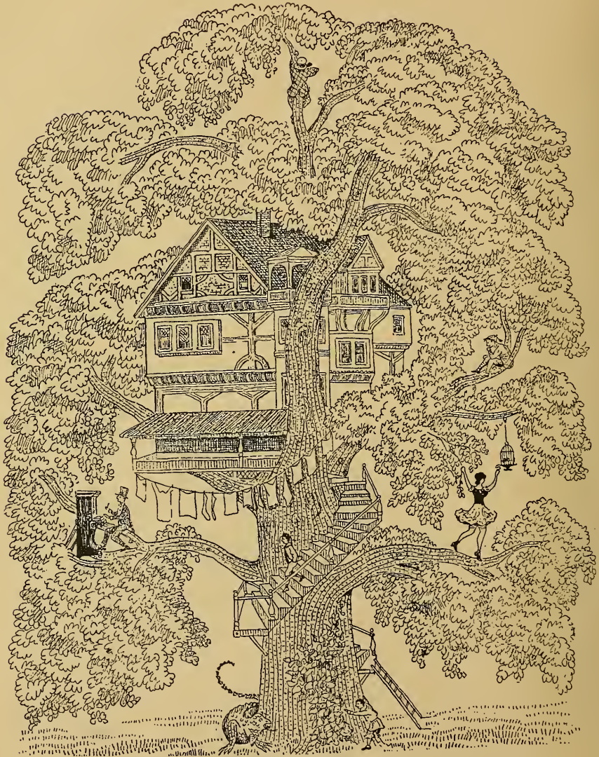
THE FAMILY TREE.